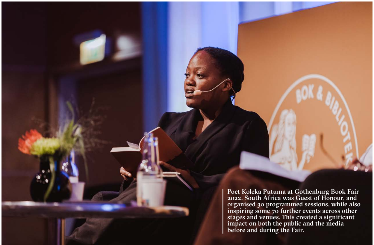
Poet Koleka Putuma at Gothenburg Book Fair 2022. South Africa was Guest of Honour, and organised 30 programmed sessions, while also inspiring some 70 further events across other stages and venues. This created a significant impact on both the public and the media before and during the Fair.